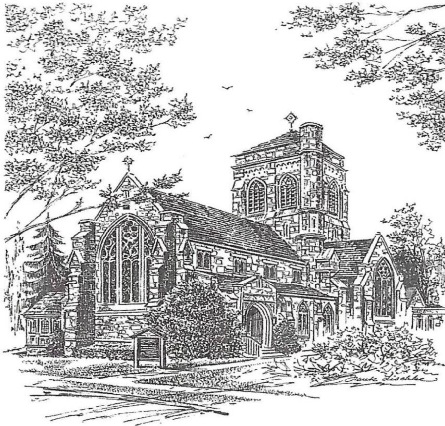
Saint Michael's Parish - Litchfield, Connecticut

Join us for worship Sundays at 8am and 10am